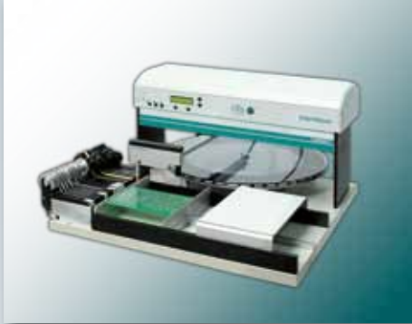
Configuration for example