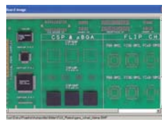
Ersas Autoprofiler: Easy offline profiling for highest machine uptimes.