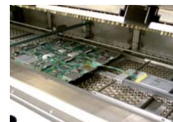
Integrated Bluetooth wireless module, Data transmission and display in real-time.