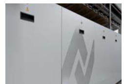
Only high quality materials are used, also in the basic system.