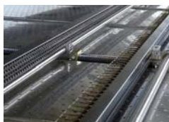
Low-mass center support