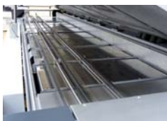
Optimized Heat Transfer, minimized \Delta T , Zone Separation