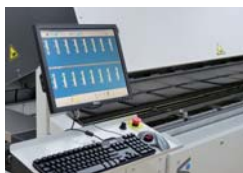
ERSASOFT: User Friendly Machine Control